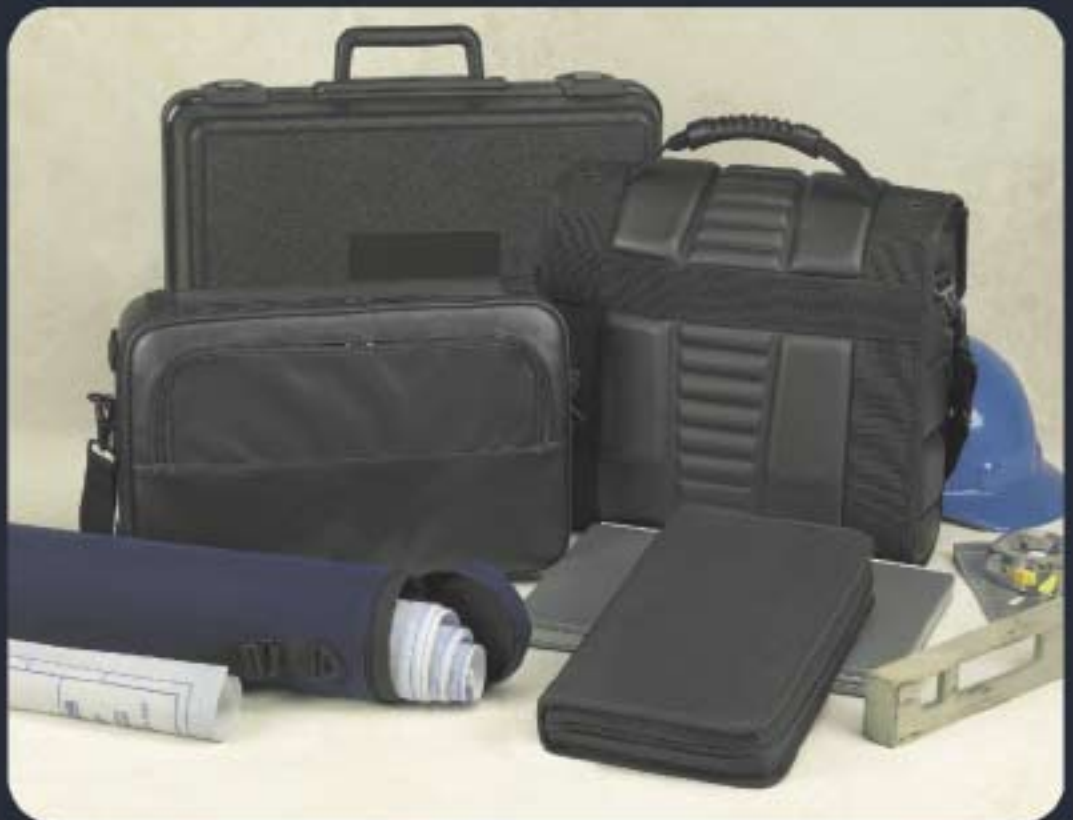
Our cases are designed to withstand rough handling. Blow molded cases can house global positioning systems, while formed laptop cases and blue print cases offer the extra protection needed at the work site.