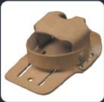
Royal Case offers endless capabilities for rugged, high quality leather products.