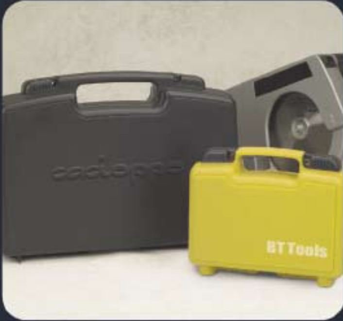
Heavy-duty molded cases can be customized in a variety of ways. The samples shown feature a logo molded into the plastic (black case), and silk screened logo (yellow case).